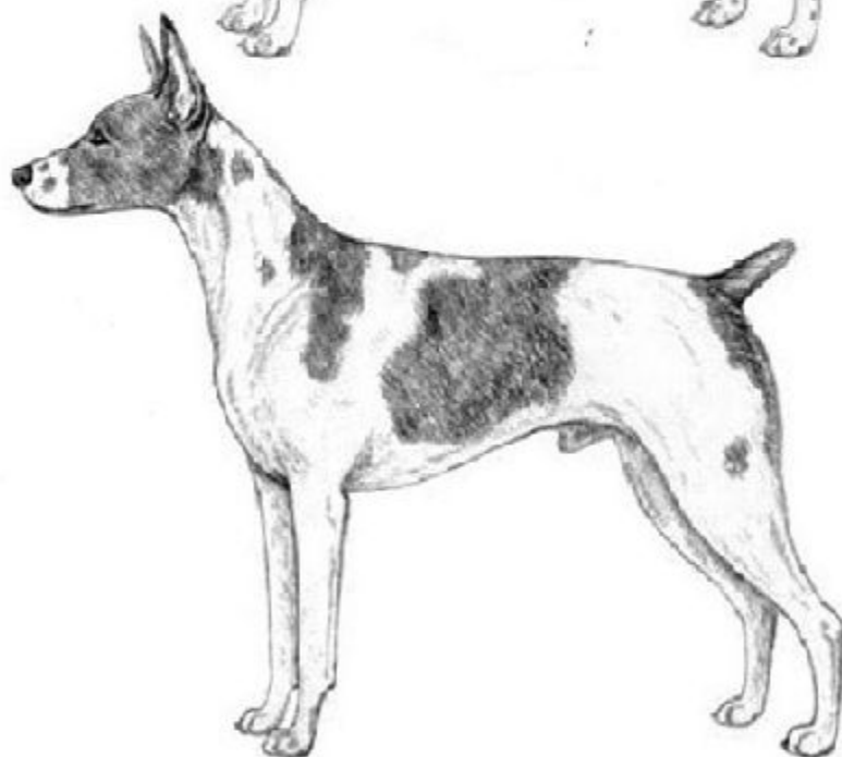
Drawings courtesy of the American Hairless Terrier Association.